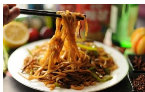
Chow mein noodles