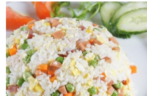
Egg fried rice