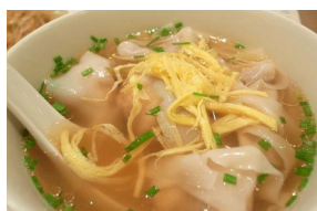
Wan Ton Soup