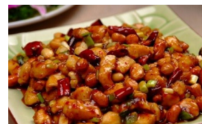
Kung Pao Chicken