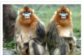
Golden snub nosed monkey